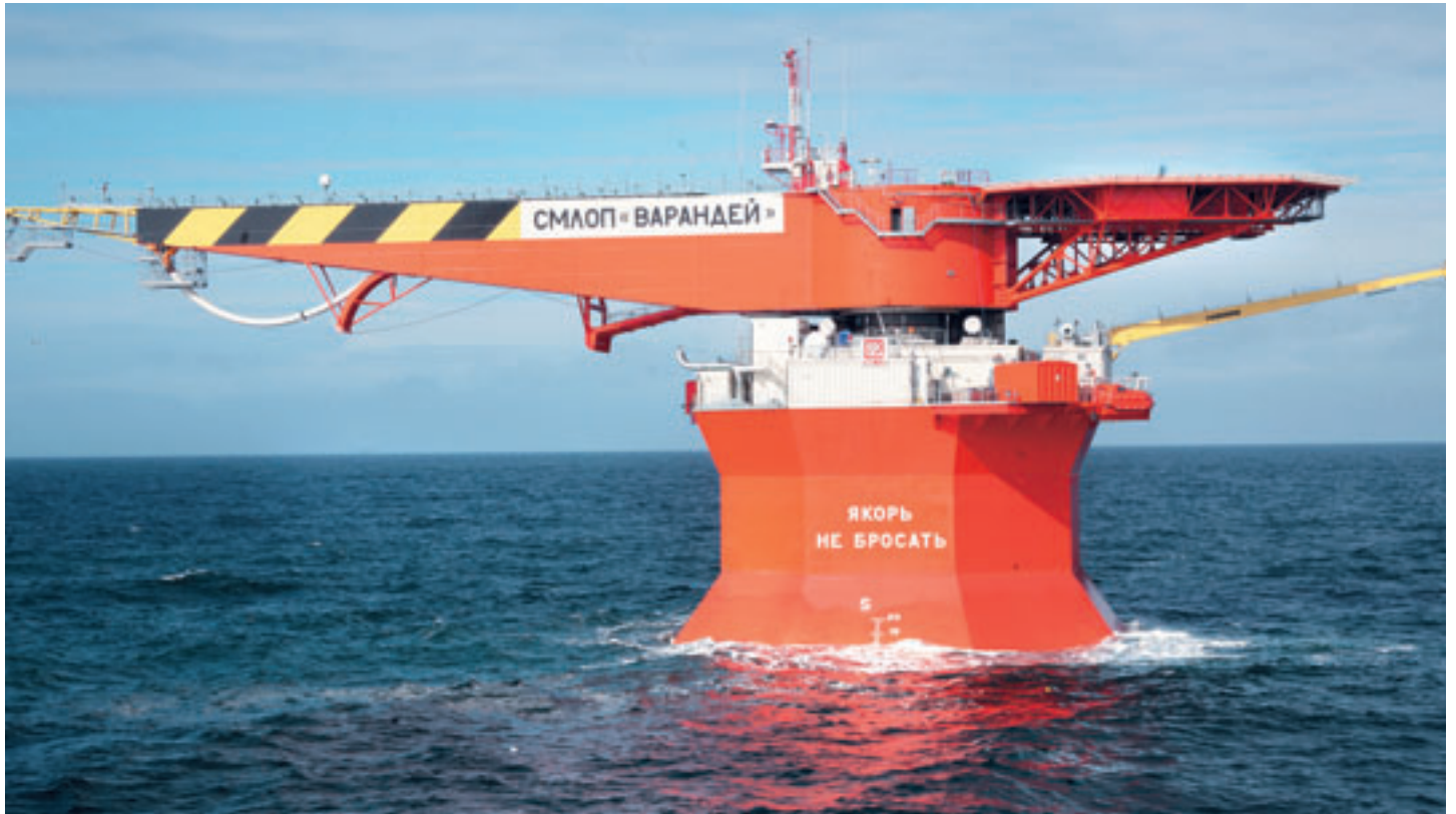
The world's first Fixed Offshore Ice-Resistant Offloading Terminal in place, 12 miles offshore of Varandey city, Russia.

An idea to build an offshore fixed terminal as part of VOLT was studied by LUKOIL for several years and in 2005 particular steps were taken to implement the project: LUKOIL-Kaliningradmorneft was assigned general construction for the FOIROT Construction whereas CDB Corall (Sevastopol) got the responsibility for designing the FOIROT.