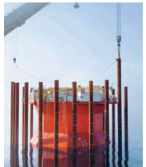
Poles are forced down into the seafloor to stabilise the FOIROT Russia.

The FOIROT crew consists of eight people each with a single-person cabin at their disposal. An additional four can stay in two-person cabins.